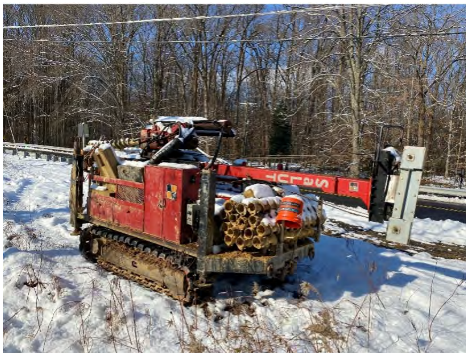
Boring rig staged on Live Oak Drive.