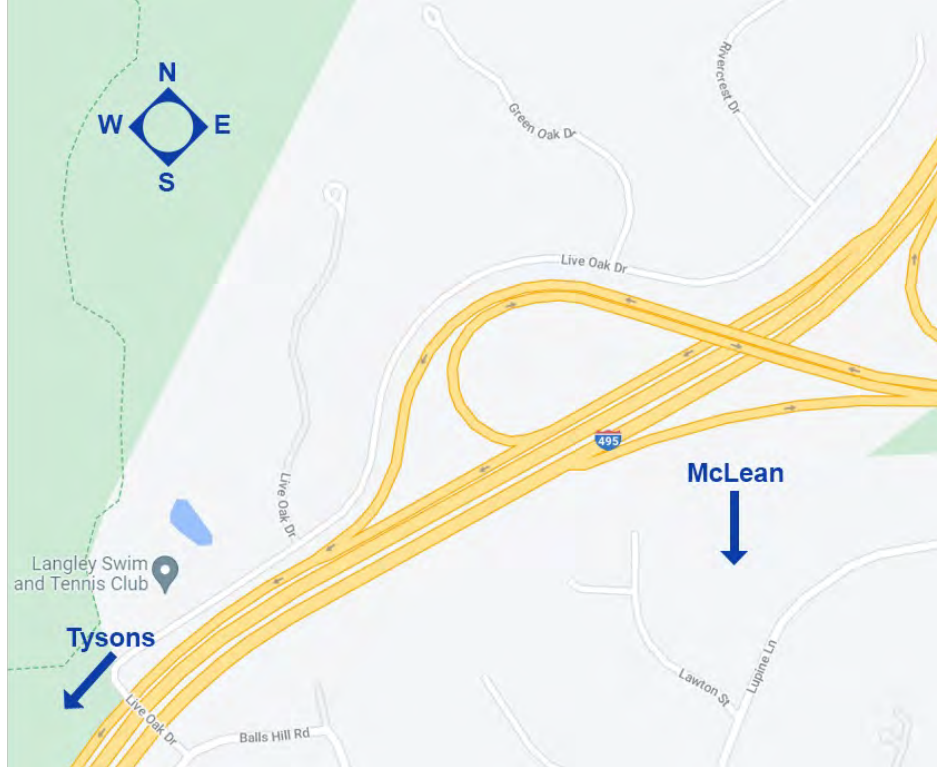
Map shows areas where geotechnical borings will take place as of January 2022.