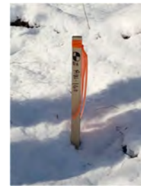
Test boring location stake.

This January, geotechnical test borings will be performed in approximately 50 locations along the 495 NEXT project corridor adjacent to the Capital Beltway. Depending upon weather and other factors, the borings are expected to be completed in spring 2022.