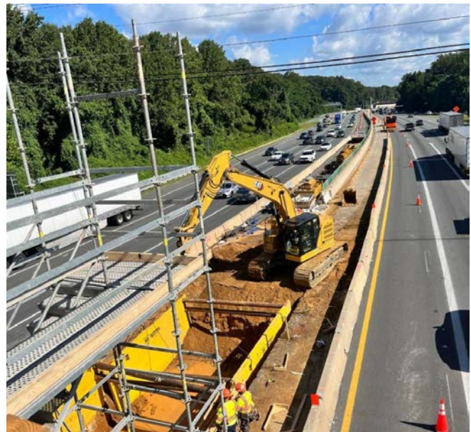
As Beltway traffic passes in both directions, an excavator removes soil to enable construction of a foundation for the new Georgetown Pike Bridge.

Additionally, crews are beginning preparations for replacing the bridge crossings at Live Oak Drive and Old Dominion Drive. Preparations include mobilizing equipment and jackhammering and excavating the median on I-495 below these bridges. Drilling for the foundations of the new bridges will start in November.