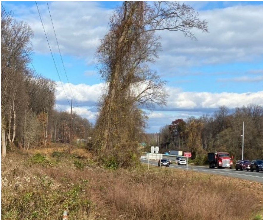
Viewed from the corner of Georgetown Pike and the existing off-ramp, this narrow area of Scott's Run Nature Preserve to the right of the overhead powerlines is where clearing occurred for the 495 NEXT project.