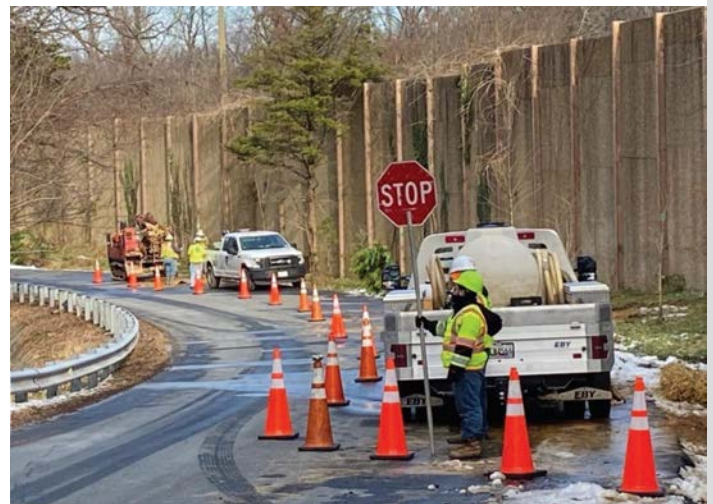
Live Oak Drive will periodically be reduced to one lane, with flaggers directing traffic.

For safety reasons, during clearing and subsequent work, Live Oak Drive periodically will be reduced to a single lane with flaggers directing traffic.