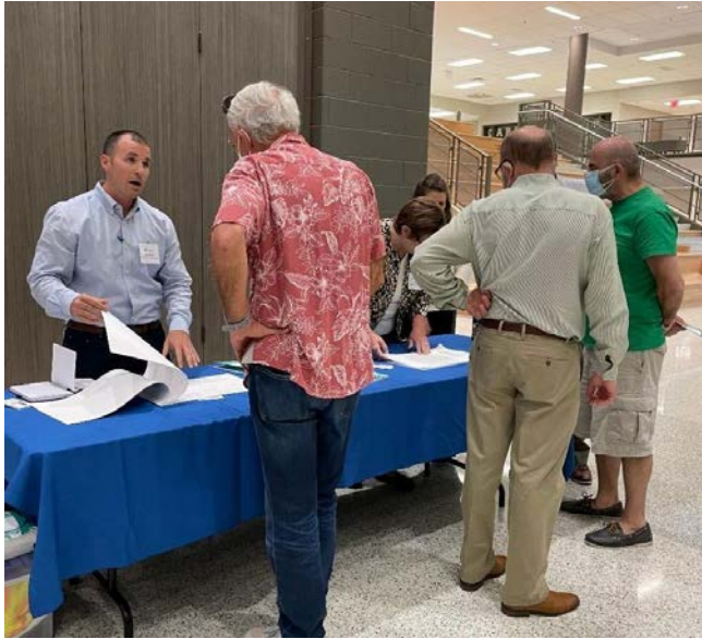
Stations dedicated to project elements were staffed by representatives from VDOT and its partners to answer questions and address comments.

included a virtual and in-person option, with a presentation followed by a question-and-answer session. Representatives from VDOT and its partners, including the Department of Rail and Public Transportation (DRPT) and the Maryland Department of Transportation (MDOT) were present to answer questions and address comments.