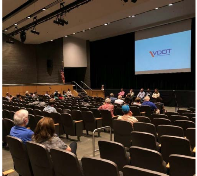
Both the in-person and virtual meetings included a presentation followed by a Q&A session.