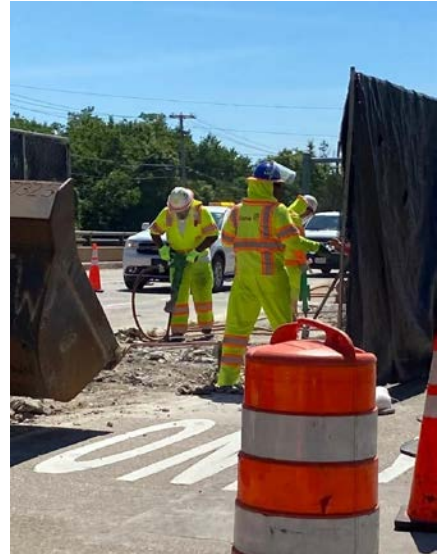
A crew member operates a jackhammer to break up the concrete median.

Work crews started demolishing the center median of the bridge in late June, and in July they will demolish the median between the bridge and Balls Hill Road. Temporary pavement will be laid where the existing medians were removed. In mid to late July, temporary traffic barrier will be installed along the westbound shoulder and both directions of traffic will be shifted south on the bridge. Temporary traffic signals will be installed to enable the removal of the existing signals. Lane closures in both directions are being implemented during non-peak travel periods (midday and overnight hours) to carry out the work safely and efficiently.