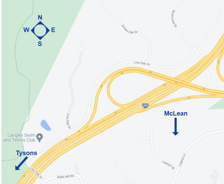
Map shows areas where geotechnical borings will take place as of January 2022.