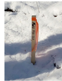
Test boring location stake.

This January, geotechnical test borings will be performed in approximately 50 locations along the 495 NEXT project corridor adjacent to the Capital Beltway. Depending upon weather and other factors, the borings are expected to be completed in spring 2022.