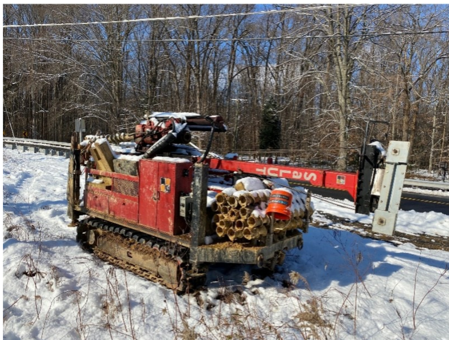
Boring rig staged on Live Oak Drive.