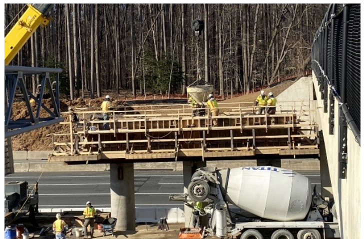
495 NEXT project crews work on constructing the center pier of the replacement Live Oak Drive Bridge, which is being built immediately south of the existing bridge.